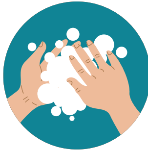
Wash your hands regularly