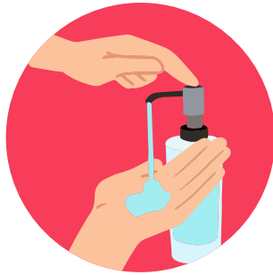
Use hand sanitiser frequently