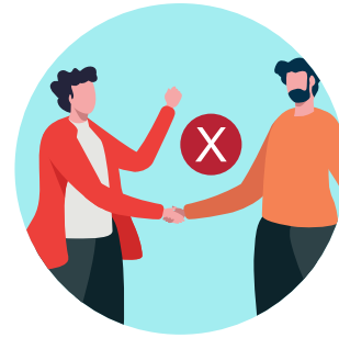
Avoid contact with others